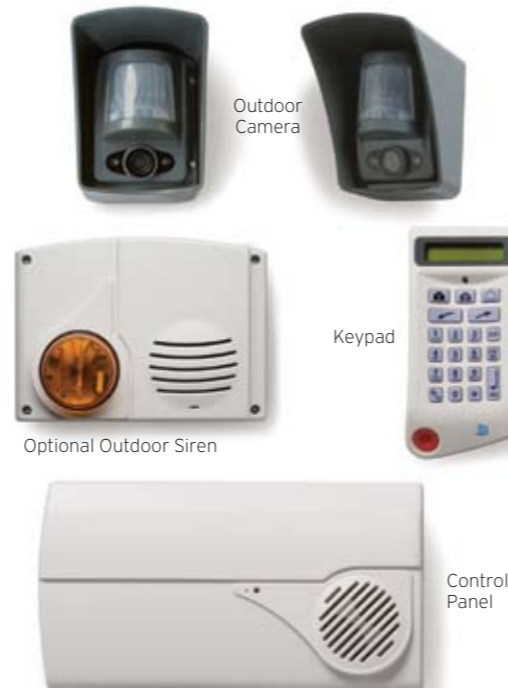
Optional Outdoor Siren