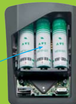
Self Powered (up to 2 year battery life)